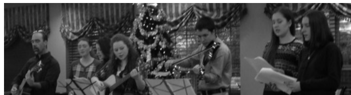
Leading Christmas carols at Cibolo Creek Nursing Center.

Full Production Rehearsal: Sat. March 5 th 10 a.m. - 2 p.m. (Lunch Served) Performances: (see below)