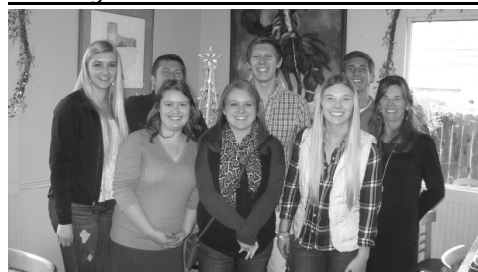
s 3 Heep reunion lunch