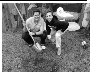
Watch for sprinkler lines.