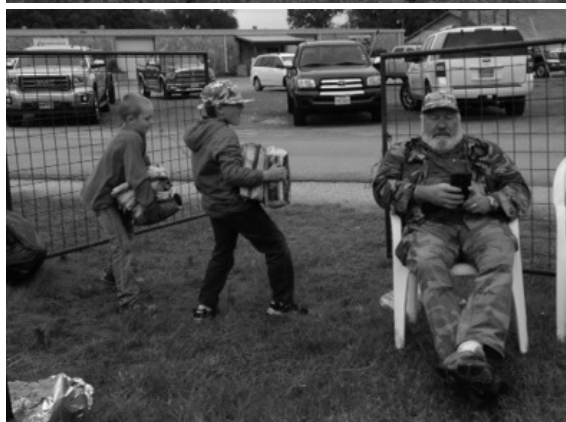
How the work gets done. "Good job boys!"