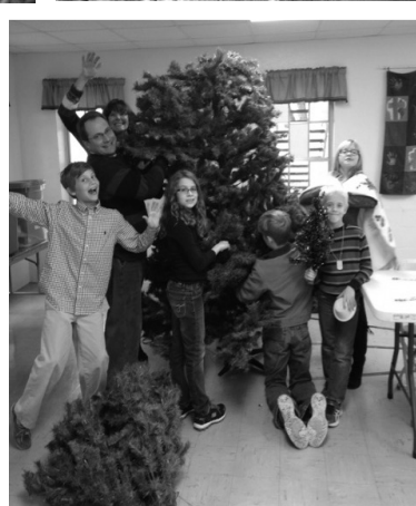
Deck the halls...Luther Hall that is!