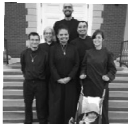
Some NALS Students and our NALS president

I look forward to seeing Y'all in December! Until then I keep you in my prayers