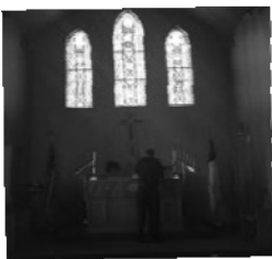
Preached at Welcome Lutheran in August while home in Texas