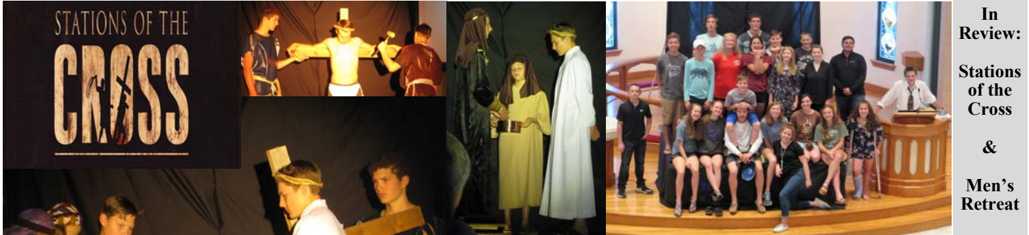
In Review: Stations of the Cross & Men's Retreat