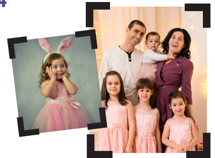
Photo shoots start at 7am and continue throughout the noon hour. There are no scheduled appointments - pictures will be first come, first served.

Let us take your family and/or individual photos and we will send you and email with a link to access to your photos. These photos will also be used to update our St. John Connect data base which will be updated at this time, as well.